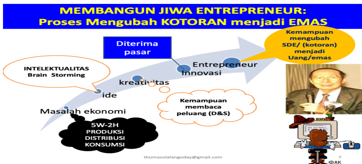
Figure 3. The Process of Building an Entrepreneurial Spirit.

Draft change dirt or rubbish into money or gold can depicted like following .